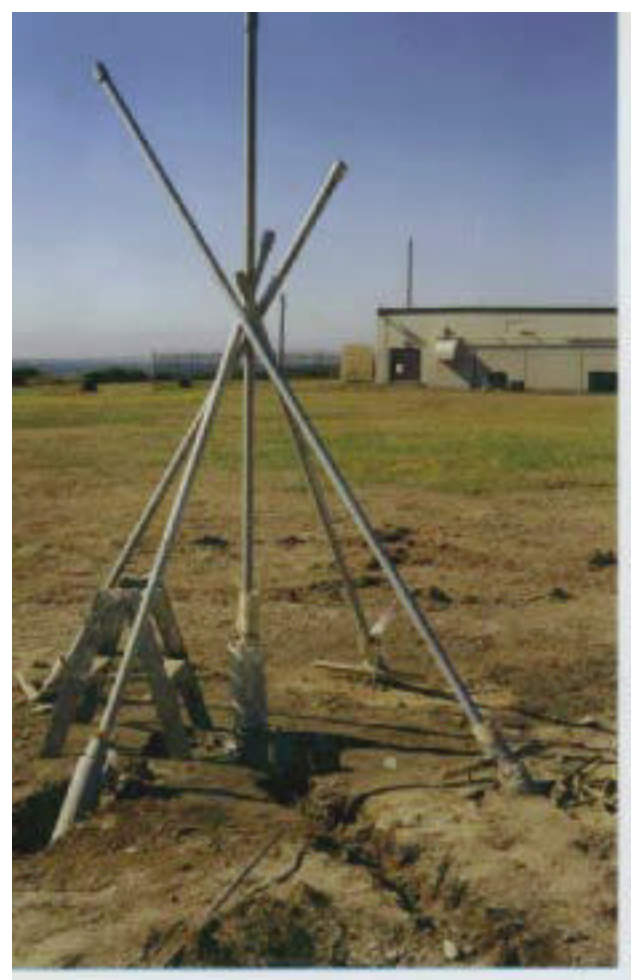
Figure 3. GPS site installation. Deeply anchored, drilled braced monument installed at Cape Blanco, Oregon. Each of five pipes drilled to approximately 12 meters depth, set in non-shrink grout, and isolated from soil and ground motions in the upper 4 meters by padded casing. The Pacific Northwest offers challenging conditions for stable site conditions. Much of the area is underlain by pervasively jointed volcanic rocks, poorly consolidated Tertiary strata, or other unstable lithologies. This monument was designed to provide stability under such conditions.