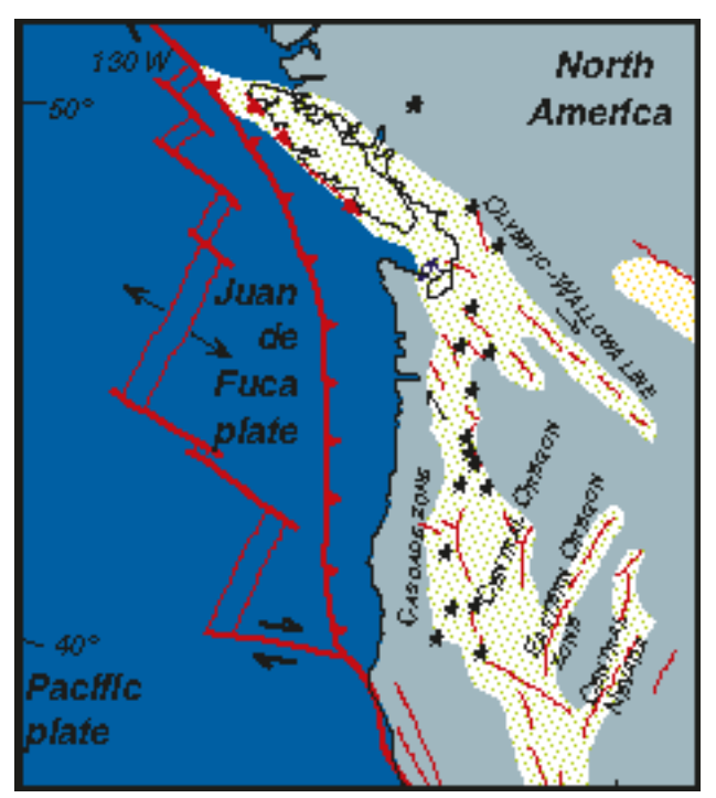
Figure 2. Tectonic setting of the Cascadia margin. The Juan de Fuca plate system lies between two migrating triple junctions. Because of entrainment of the western margin of North America in Pacific plate motion, the Pacific Northwest is deformed in response to the interaction of all three plates. Stipple areas show actively deforming zones; the red arrow shows the Juan de Fuca-North America convergence direction. Base map from Pezzopane and Weldon (1993).